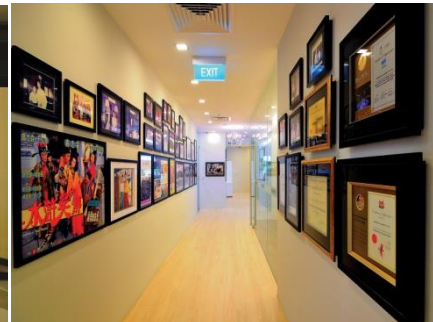
Passage Way to Classrooms